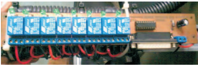
Fig. 3. Control board

VRT nozzles consist of a ball valve, DC motor, two gears, chain and nozzle as in Fig. 2. The first gear is attached to the DC motor and the second one is attached to the ball valve. The gears are connected together by a chain. A clockwise rotation will open the valve meanwhile a counter clockwise rotation will close the valve. After the signal was sent from relay to DC motor, the motor will rotate the first gear. Then, the rotation caused the chain to move, eventually rotate, the second gear. The opening and closing of the valve will depend on the signal that was sent by a relay. If the second gear rotated 45°, the ball valve is only half open. If the second gear rotated 90°, then the ball valve is fully open. For example, if the signal received by a relay with the indicated percentage of weeds, 27%, it means the percentage of weeds within range 3–50% which means that the half opening operation would be activated. So, the first gear will only rotate 45° and cause that the ball valve is open in half operation.