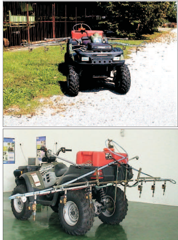
Fig. 1. Front and back view of smart sprayer

The length and size of the galvanized pipes and hoses are one of important criteria. A hose and fitting to handle water operating pressure and quantities are selected; 1/2 inches galvanized pipes are used as the main line for a liquid flow.